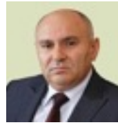
Dzhambulat Khatuov , First Deputy Minister of Agriculture of the Russian Federation