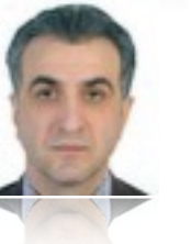
Ignaty Arakelian Minister of Agriculture of the Republic of Armenia