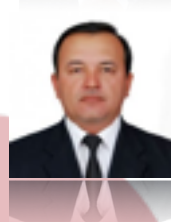
Shukhrat Teshaev , Minister of Agriculture and Water Resources of Uzbekistan